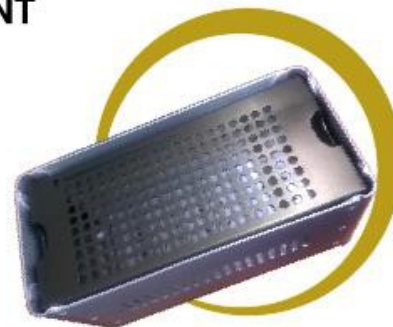
CC SCREW BOX