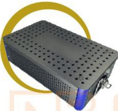
TIBIA & FEMUR BOX

We are equipped with cutting edge CNC Turret Punching Machine for all types of job works.