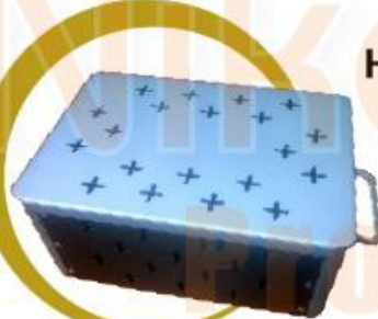
SMALL FRAGMENT BOX