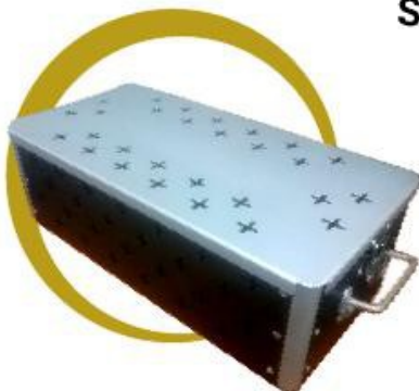
LARGE FRAGMENT BOX